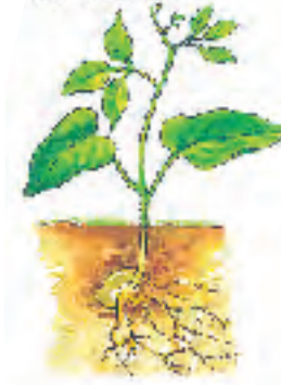
The germination of a plant